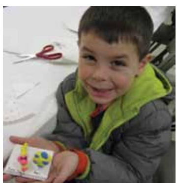
Young at Art Family Day, March 2018

Adult classes engage new and emerging artists, allowing beginning students to develop their own artistic voice and advance in techniques. Intermediate and advanced classes and workshops help established artists connect with new approaches and refine their skills.